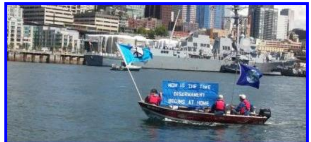
Boats by Bangor 2016 - Photo by Leonard Eiger