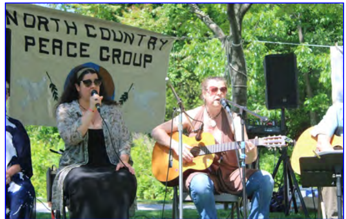
North and South Country Peace Groups held a concert in Port Jefferson on Long Island