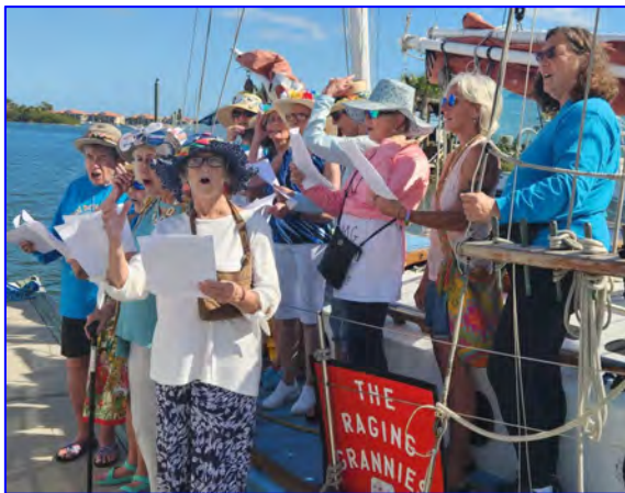
Several Raging Grannies groups sang peace songs to old familiar tunes - this one in New Smyrna, FL