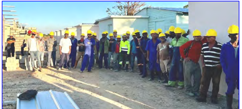
Workers were pleased to show off their work in Pinar del Rio, where ten thousand homes are being rebuilt after hurricane Ian.