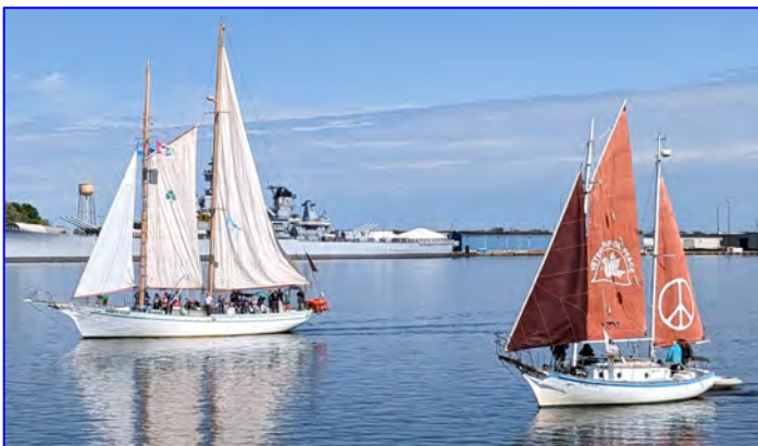
Philadelphia - Escort to the harbor by the North Wind, an older wooden boat which sails for environmental education. Golden Rule supporters filled the North Wind to capacity on this cruise around the harbor!