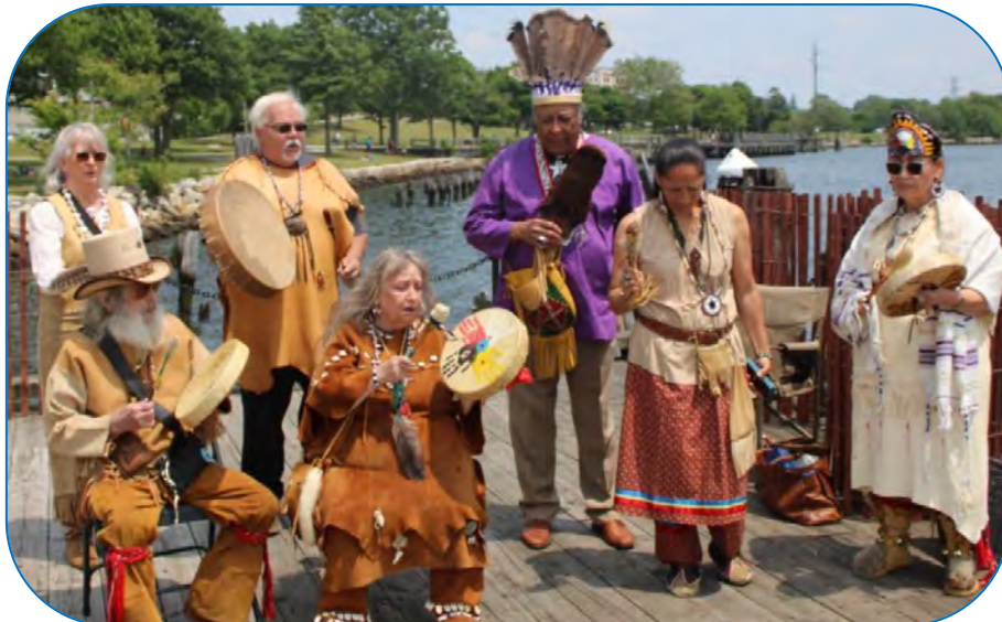
Pokanoket Tribal leaders Sagamore and Sachem with Tribal Council members welcomed the Golden Rule to India Point Park in Providence, Rhode Island.

"Welcome to the Ancestral Land of the Pokanoket Tribe. We are the direct descendents of the Massassouit Ousa Mequin who signed the 1621 Peace Treaty with the Pilgrims"... , "we extend our deepest appreciation for what you are doing. We all share Mother Earth and have to live here together. It is up to everyone to take care of Mother Earth. To do our share -- to leave it better for the next Seven Generations."