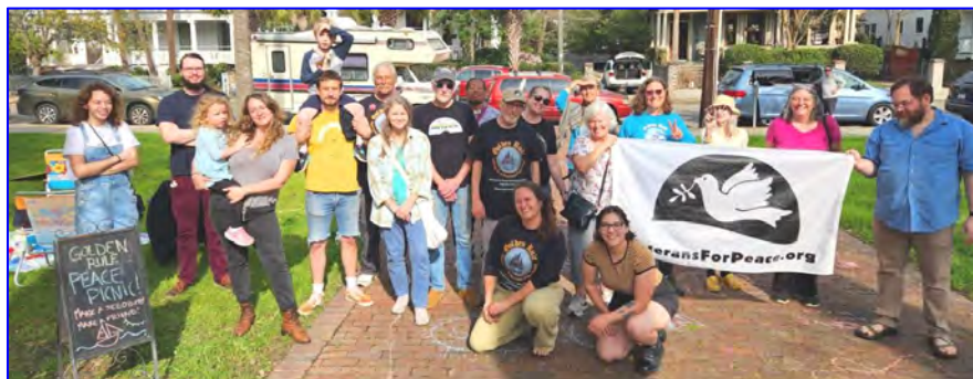
Supporters in Charleston, South Carolina gathered in the local park for a folk music concert