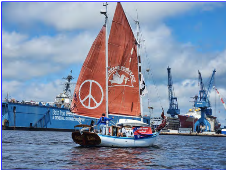
The ship of peace sails in protest of Bath Iron Works, makers of nuclear-capable war ships