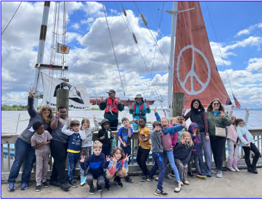
Montessori students in Havre de Grace