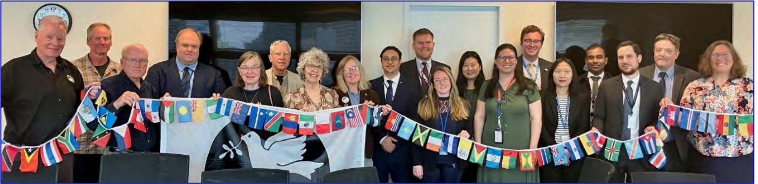
Veterans For Peace and the Golden Rule team met with 13 UN missions, including Mexico, New Zealand, Malaysia, Vietnam, Cuba, South Africa, Austria, Indonesia, Ireland, Costa Rica, Kiribati, and the Vatican