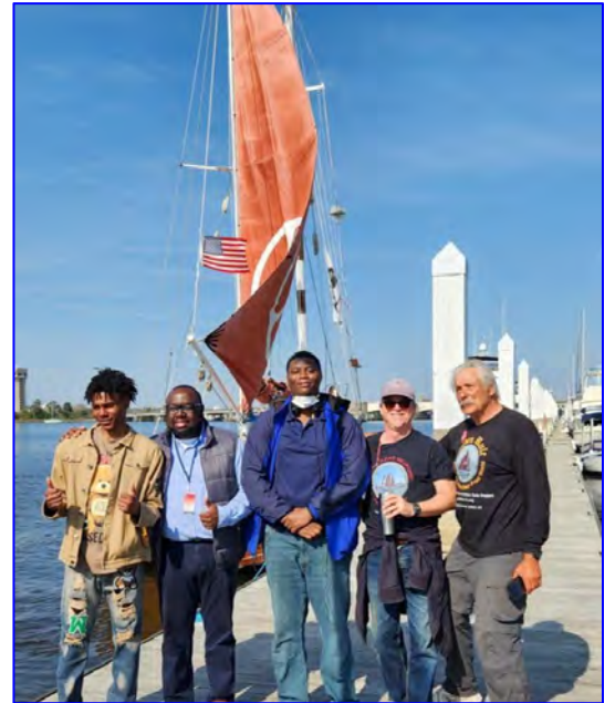
Students from historically-black Burke High School in Brunswick, Georgia