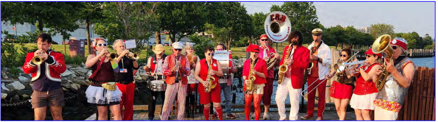
The Extraordinary Rendition Band played rousing music on the dock!