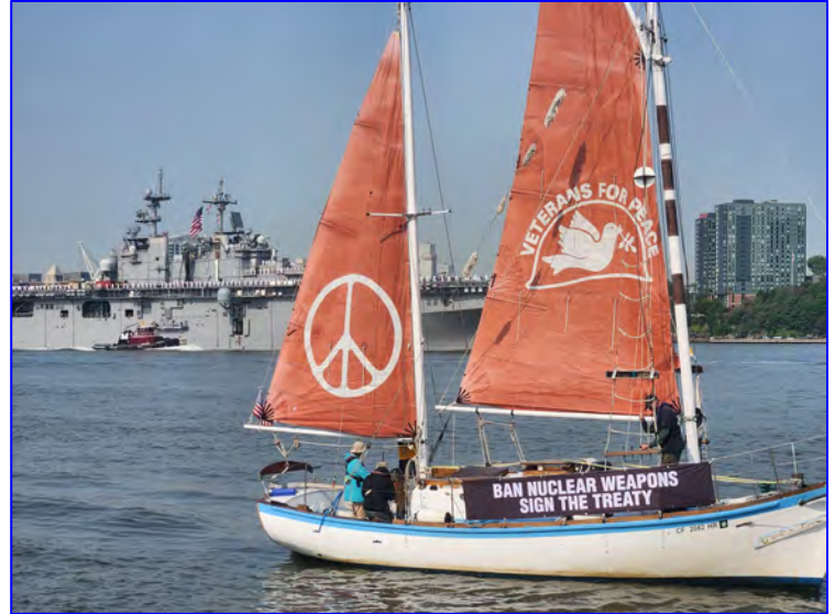
Fleet Week Parade of War Ships Hudson River, New York City