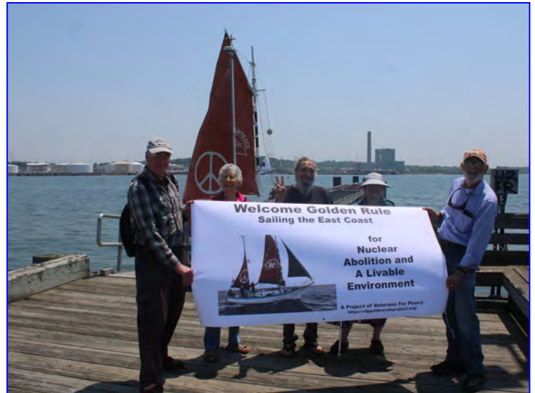
The Golden Rule was welcomed by New Haven, Connecticut activists, and took several groups out to sail by Electric Boat in nearby Groton, manufacturer of nuclear-armed submarines.