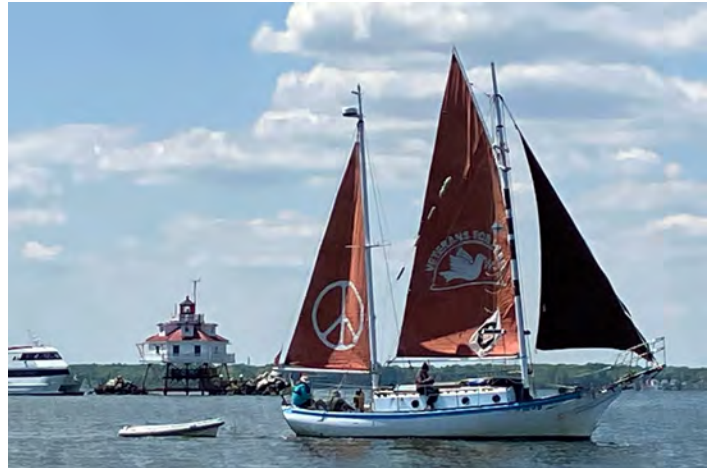
The Golden Rule in Baltimore Harbor

They said it couldn't be done. But what a ride it has been! The historic Golden Rule peace boat, a national project of Veterans For Peace, has sailed most of the way through the "Great Loop" waterways of the Midwestern, Southern and Northeastern U.S. The impact has been very large and continues to snowball. Our message of peace and nuclear abolition has reached hundreds of thousands of people. Thousands have visited the boat. Thousands more have organized local events in over 70 towns and cities. Our captains, crews and coordinators have been interviewed scores of times on radio and TV, in newspapers and online.