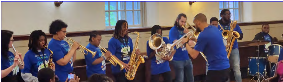
A youth brass band was part of an afternoon of music in Baltimore