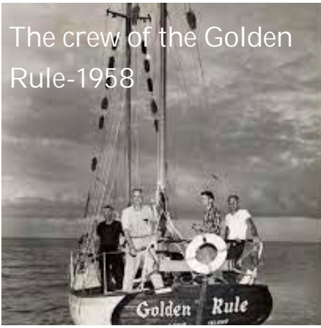
The crew of the Golden Rule-1958