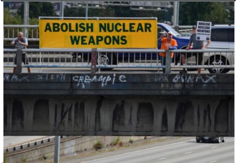
Article by Leonard Eiger, Ground Zero Center for Nonviolent Action

Peace activists from grassroots organizations around the Puget Sound in Washington State held banners for the International Day of Peace (September 21st) and the International Day for the Total Elimination of Nuclear Weapons (September 26th).